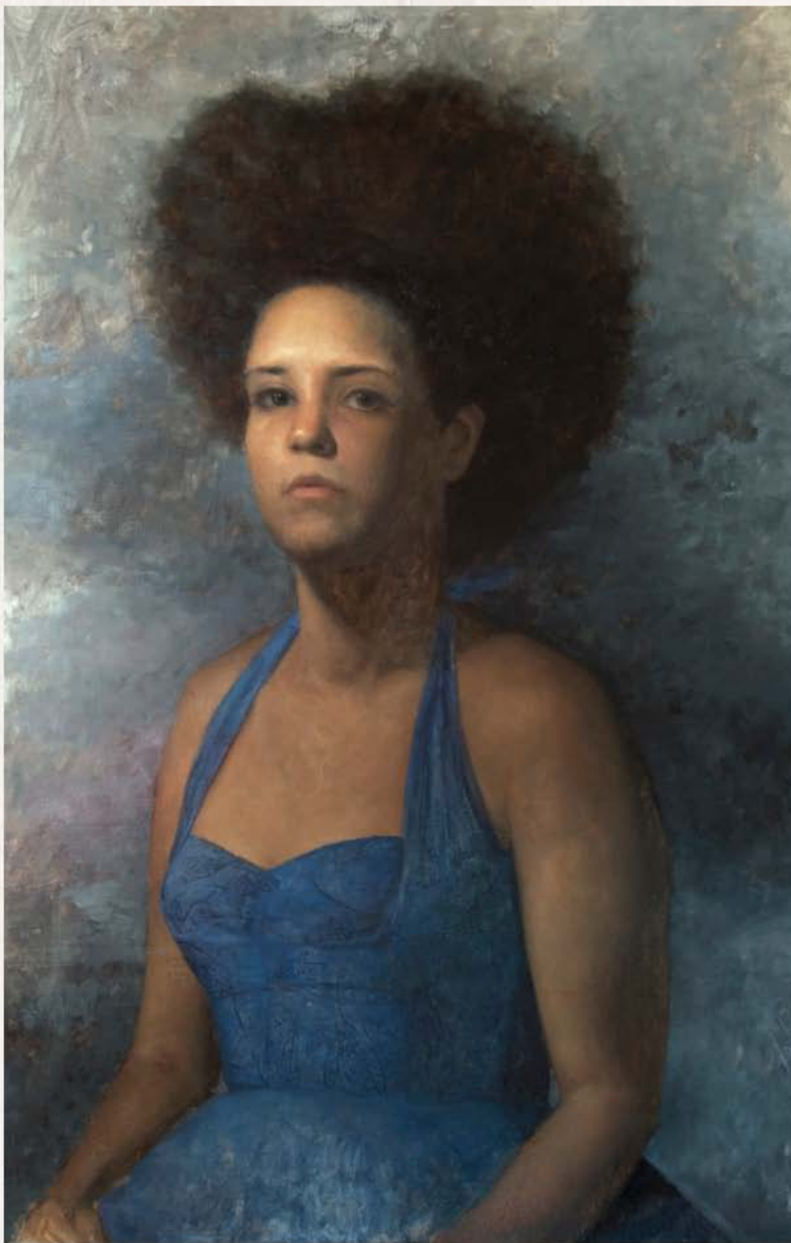
Oil on linen, 24" x 36" (2011)