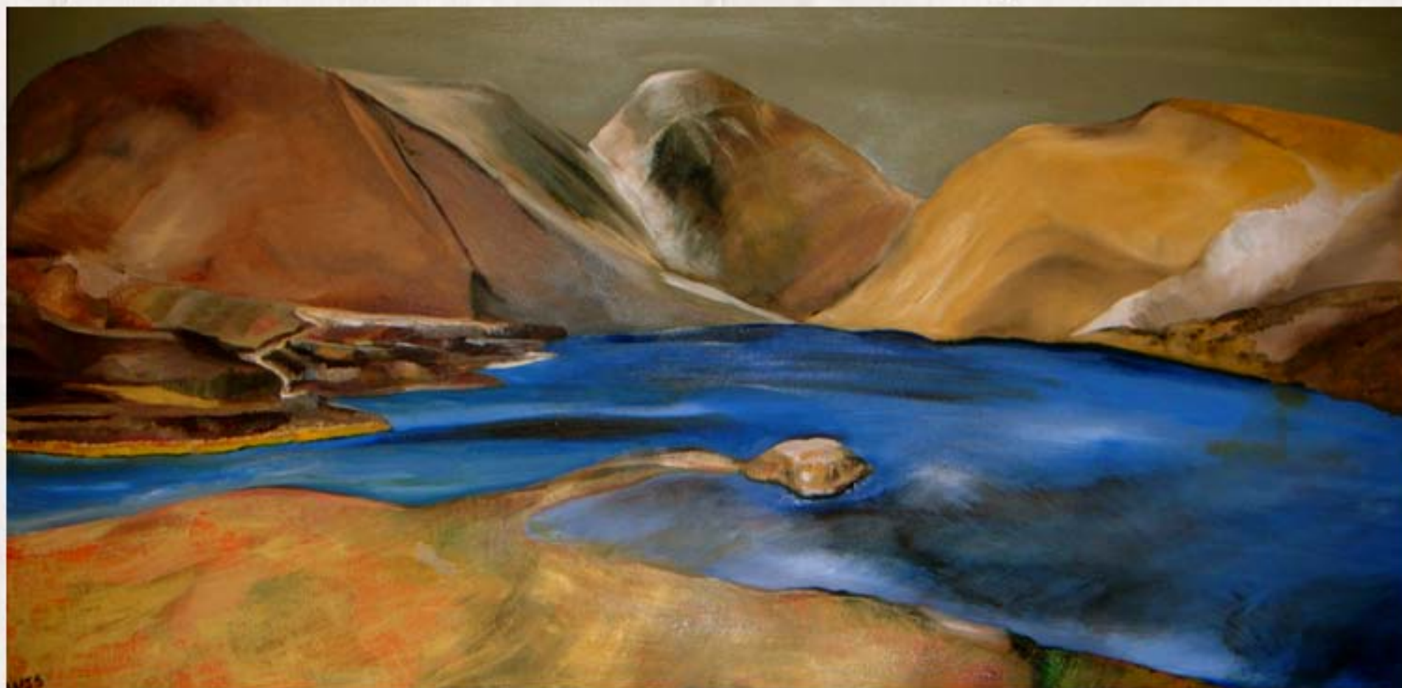
Trapeze Artist Oil on canvas, 4 ft x 2 ft

© 2012 Works & Days Quarterly and Willow Jane Sainsbury