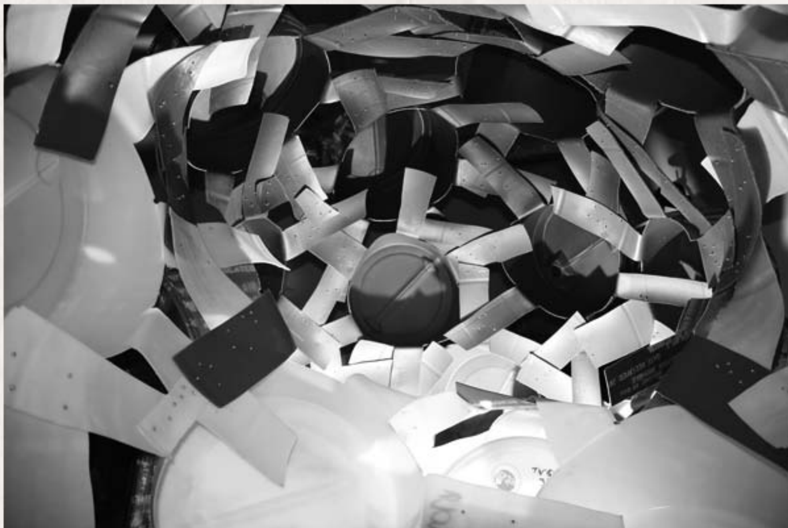
← Inside Sculpture →

1 2 3 4 5 6 7 8 9 10 11 12 13 14 15 16 17 18 19 | pdf