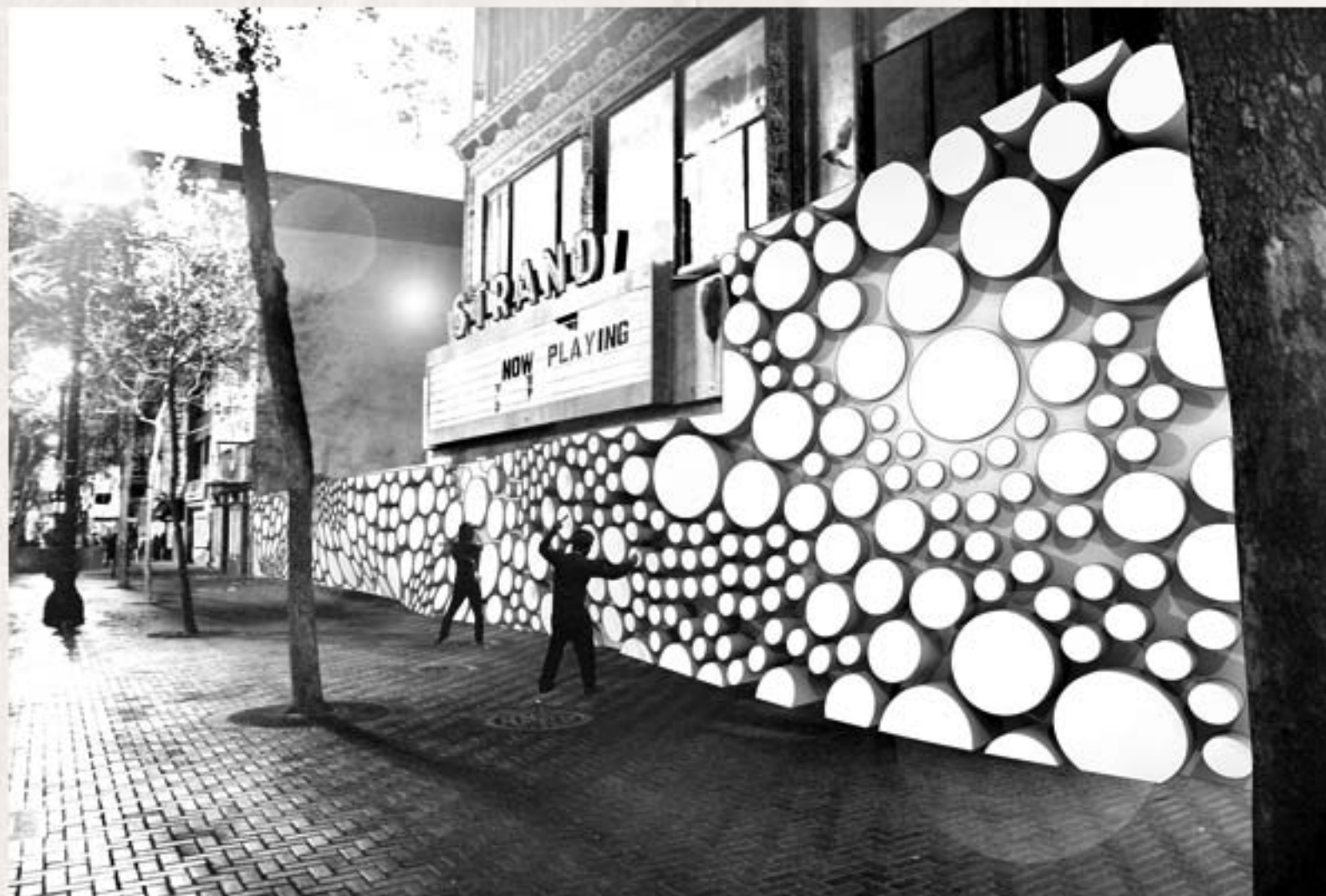
Competition Winning Drum Mural

1 2 3 4 5 6 7 8 9 10 11 12 13 14 15 16 17 18 19 | pdf