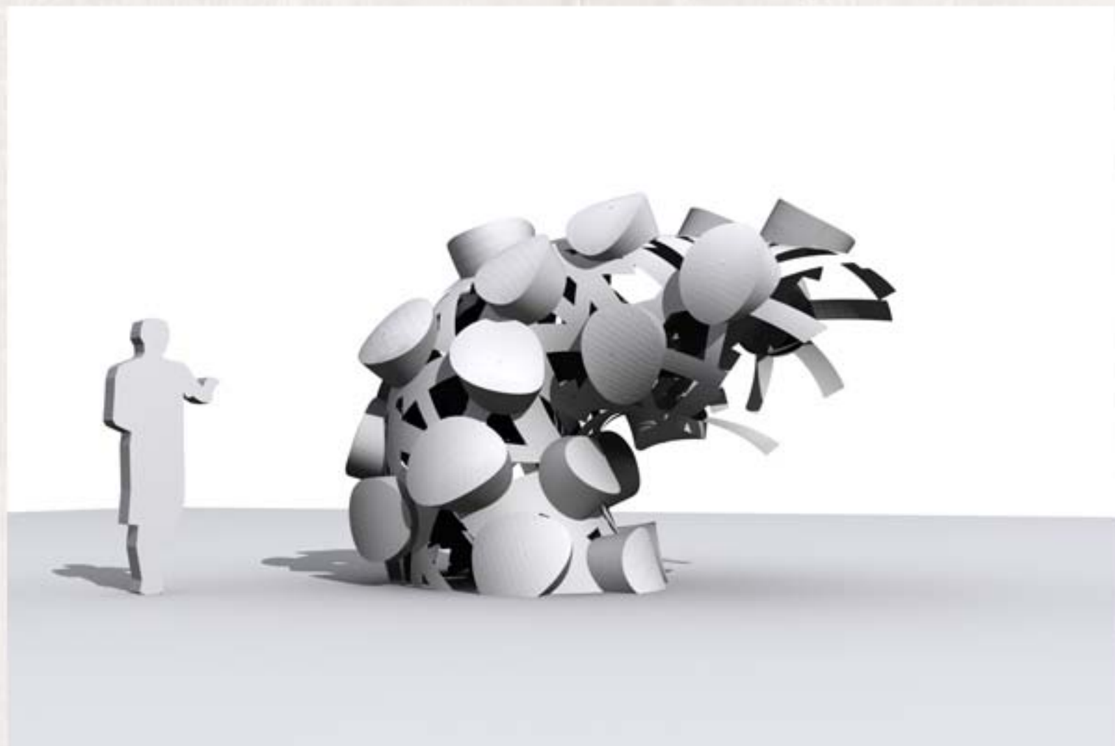
Drum Sculpture Design

1 2 3 4 5 6 7 8 9 10 11 12 13 14 15 16 17 18 19 | pdf