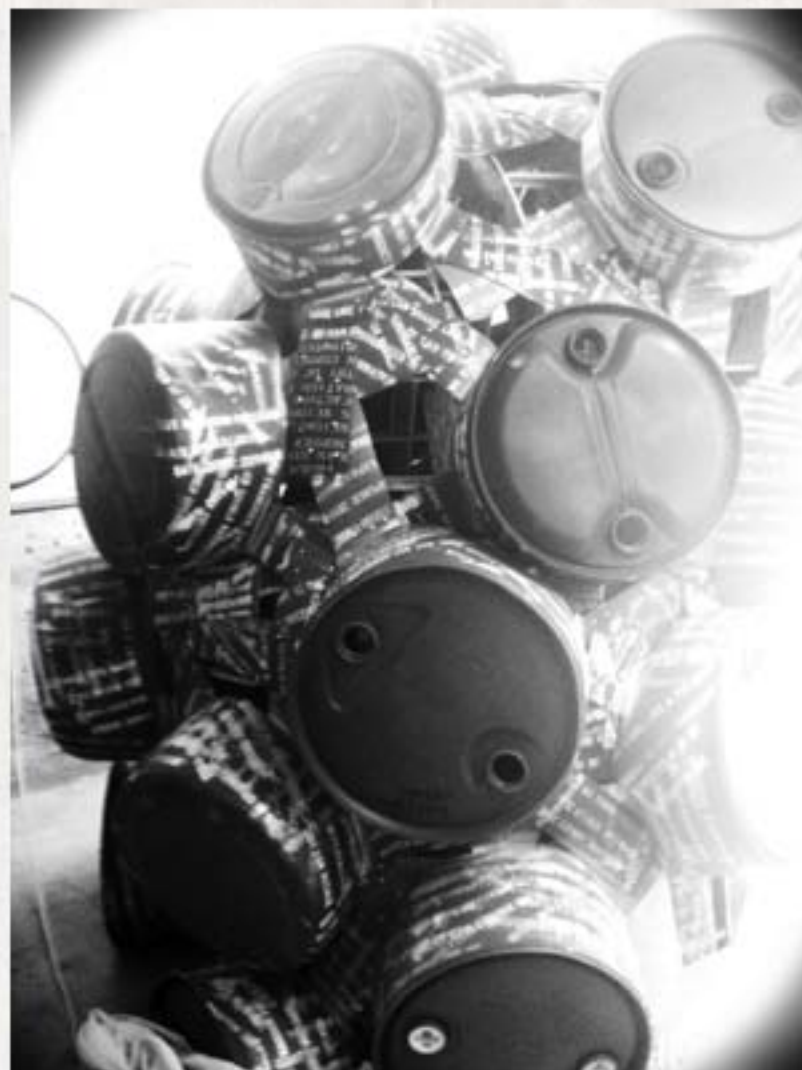
Assemble on Skeleton

1 2 3 4 5 6 7 8 9 10 11 12 13 14 15 16 17 18 19 | pdf