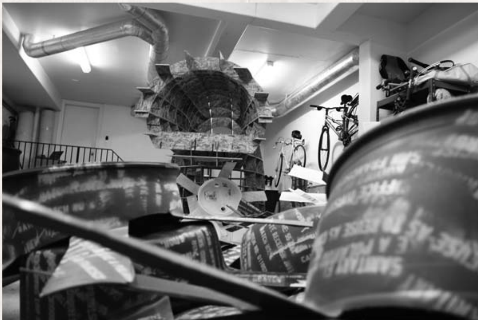
← Cut n Stencil Barrels →

1 2 3 4 5 6 7 8 9 10 11 12 13 14 15 16 17 18 19 | pdf